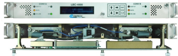
LBC-4000 with open front panel